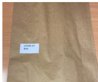
b. Place this large evidence bag in a brown evidence bag, clearly marked COVID-19 risk