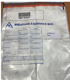
a. Place sealed bags in large evidence bag marked COVID-19 risk