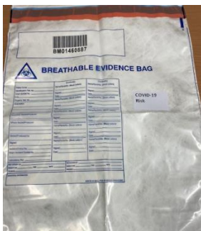
a. Place sealed bags in large evidence bag marked COVID-19 risk