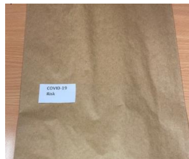
b. Place this large evidence bag in a brown evidence bag, clearly marked COVID-19 risk