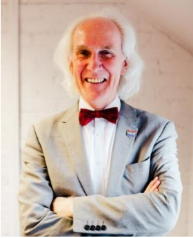
Consultant Forensic Physician

I have been working as the Designated Doctor for Child Safeguarding for Wandsworth CCG for the past 13 years, as well as working for over 39 years as a Forensic Physician. I continue to work as a Sexual Offences Examiner for CSA cases as I have done for most of my career.