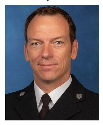
Head of National Roads Policing Operations Intelligence and Investigations